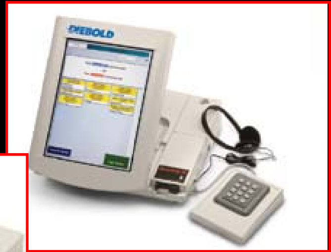
Touch Screens – DRE / HAVA Required Equipment