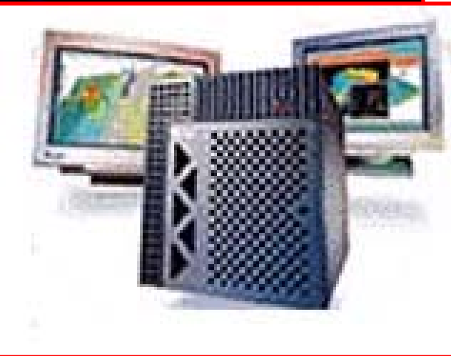
Election Management Software